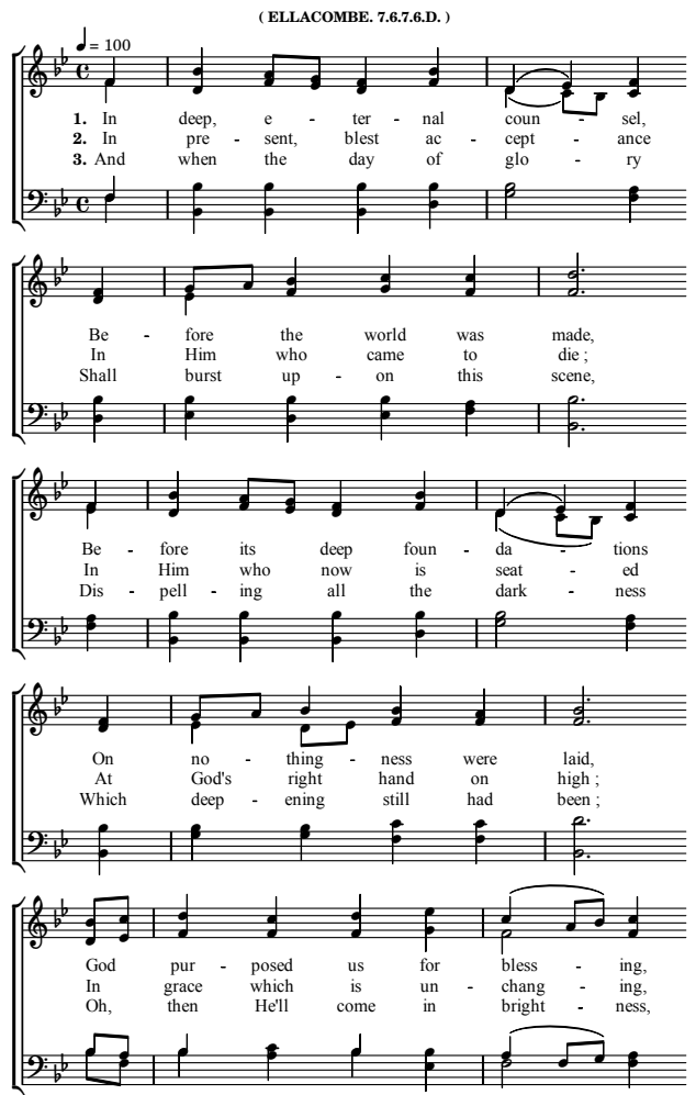
In deep, eternal counsel